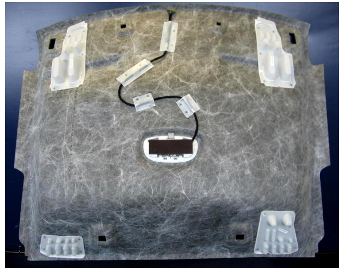
Figure 3. HIC and wire retention clips secured to headliner by InfraWeld process

Machines heated the adhesive to the appropriate processing temperature, and either an operator handling a manual dispensing device or a robot with a dispensing tool system applied it to the headliner. The operator or an automated device then positioned the B-surface components into the adhesive on the headliner before the adhesive would cure. The hot-melt was a messy, heavy consumable, and the heated dispensing devices presented a burn hazard to the operators along with a general maintenance burden.