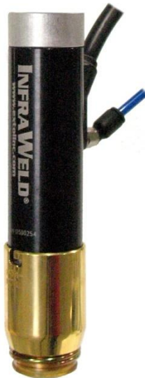
Figure 1. InfraWeld module

Engineers may choose from multiple plastic joining methods when contemplating assembly, and although light energy may not be at the top of the list of choices...in some cases it should be. The InfraWeld process, offered by Extol, Inc. of Zeeland, Michigan, harnesses infrared (IR) light energy for through-beam welding. Engineers have successfully implemented the process in many challenging and highly sensitive applications across multiple industries. One example, bonding head-impact countermeasures (HIC) and wire retention clips to the B-surface of automotive headliners, reduces weight and cost by eliminating adhesives. The automotive industry has utilized this exceptional technology in other applications such as attaching noise, vibration, and harshness (NVH) pads to interior trim panels, and assembling taillight inner lenses to bezels. The medical device industry has embraced the InfraWeld process to eliminate adhesives in applications such as simultaneous, full perimeter, through-beam welding of concentric thermoplastic tubes.