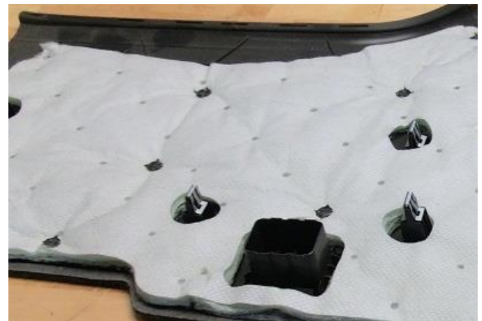
Figure 7. NVH pad bonded to trim panel with the InfraWeld process

Previously, either pressure sensitive adhesives or ultrasonic welding methods were used to attach NVH pads to trim panels. Pressure sensitive adhesives added an extra component to the assembly and required the disposal of backing paper during every assembly. Pressure had to be applied to the length of adhesive to bond the components together, which is complicated by the contour of trim panels. Ultrasonic welding offered an advantage over adhesives, eliminating the need for an extra component in the assembly, but introduced the risk of marking the A-surface during the welding process.