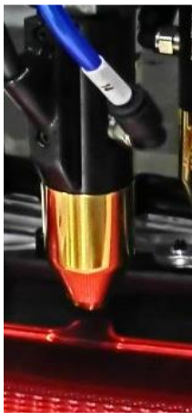
Figure 5. Welding taillight inner lens to bezel

An additional advantage in using the InfraWeld process in this application was that molded energy directors or weld ribs were not required. The InfraWeld process achieved a homogenous bond between the lenses at the spot-weld locations with flat surfaces.