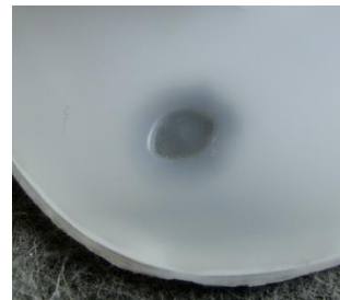
Figure 4. Close-up of HIC InfraWeld spot-weld

In this case, the concentrator was equipped with a flexible seal to retain pressure at the contact surface and to assure application of a calibrated force to mix the PP into the Azdel surface of the headliner. In the heating process, the focused infrared energy was transmitted through the translucent PP components and absorbed by the grey scrim of the headliner. The heat generated at the interface softened the materials. The force generated from the pressurized module displaced the semi-molten PP surface into the headliner Azdel surface. With processing parameters of 3.5 seconds of heat time, 10 seconds of hold time, and 10 seconds of cool time, the bond achieved the parent material strength of the headliner scrim. The operator could handle the assembly immediately after the welding process.