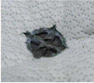
Figure 8. Close-up of NVH pad, InfraWeld spot-weld

The spot-welds achieved the parent material strength of the NVH pad. The processing parameters were 3.5 seconds of heat time and 5 seconds of hold time.