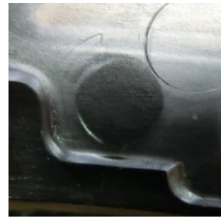
Figure 6. Close-up of polycarbonate spot-weld with the InfraWeld process

In addition to single point spot-welds produced with standard InfraWeld modules, custom InfraWeld modules can be designed and implemented to create a hermetically sealed, linear weld.